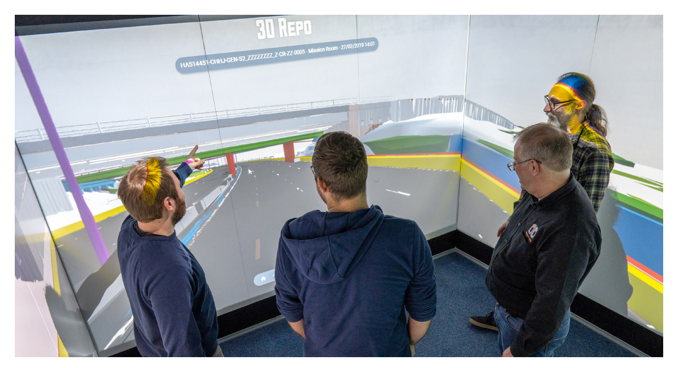
Figure 1: Viewing a model in 3D Repo inside the Mission Room Arena display. Watch the video: https://bit.ly/2Ex4Tey