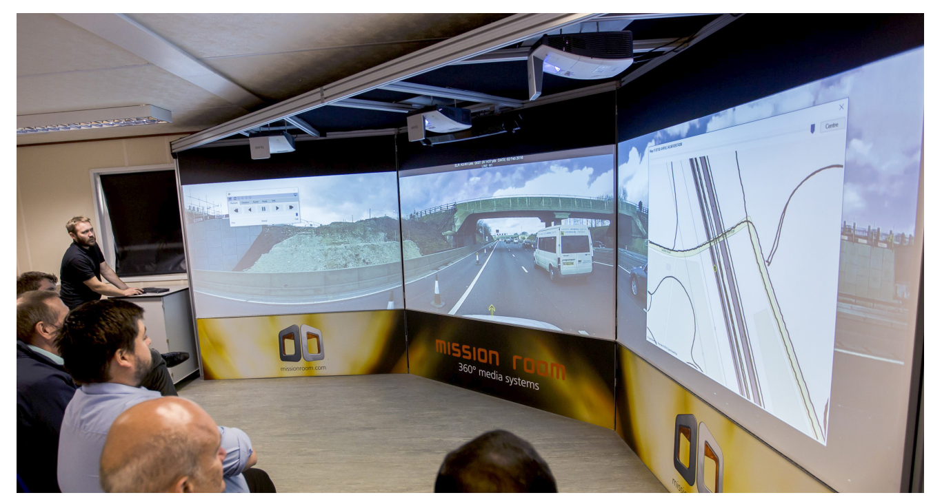
Figure 2: The Mission Room Hybrid system displays various software applications across multiple screens.