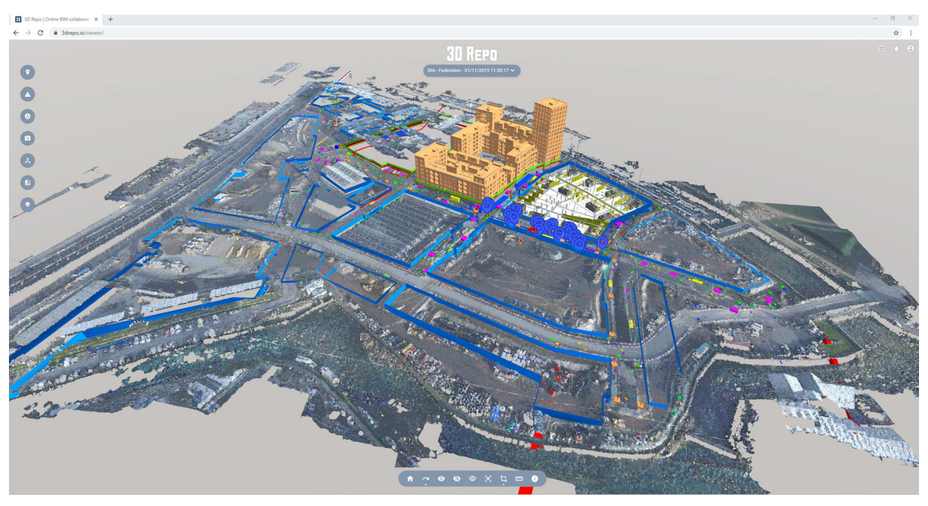
Figure 1: Federation of Sugar House Island including point cloud data in the 3D Repo platform. Watch the video https://bit.ly/2plFWPv